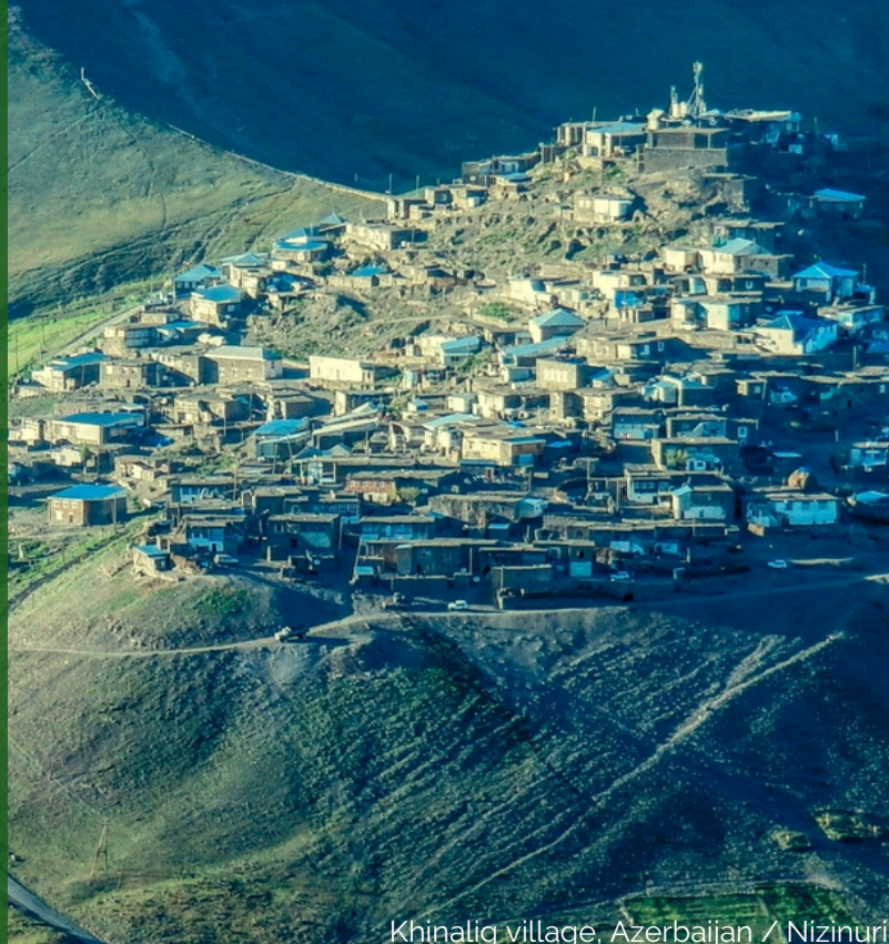
Khinalig village, Azerbaijan / Niznuri