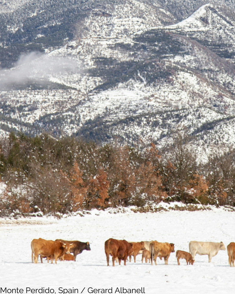
Monte Perdido, Spain / Gerard Albanell