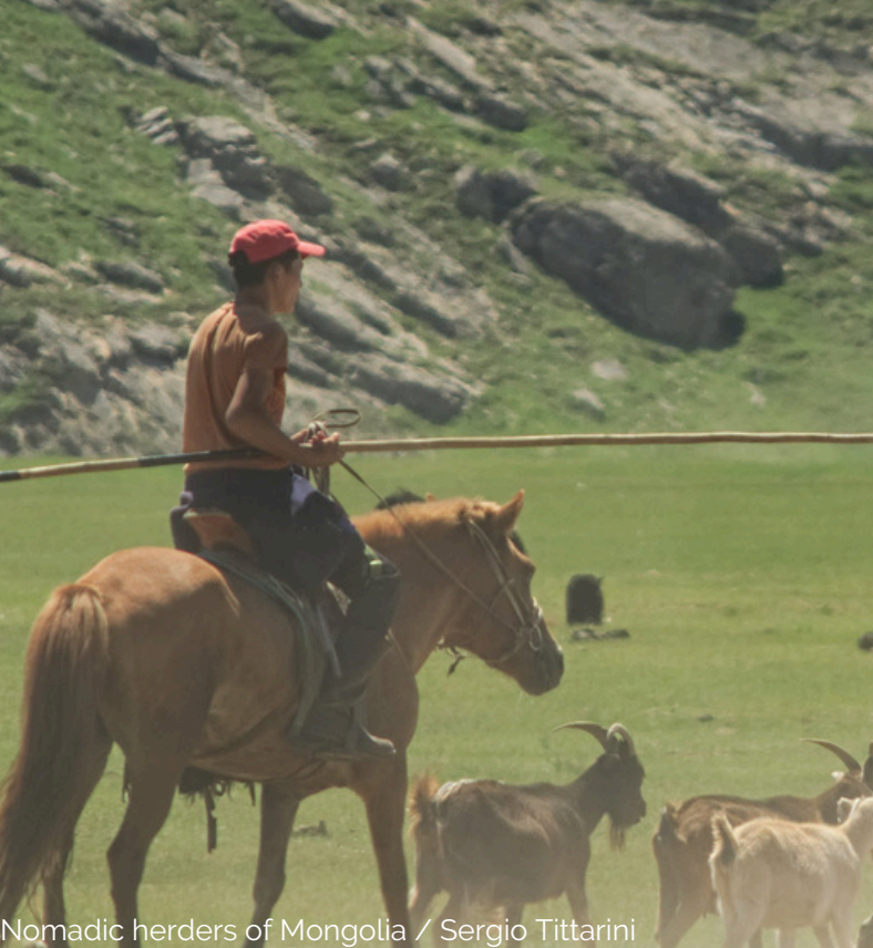
Nomadic herders of Mongolia