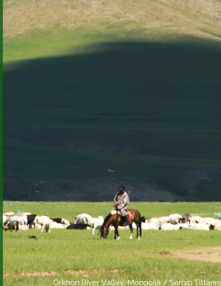
Orkhon River Valley, Mongolia

The ICOMOS World Heritage Transhumance Initiative is pleased to announce the opening of the call for poster contributions for the expert conference on Transhumance heritage taking place on 21-22 May 2024 in Baku, Azerbaijan.