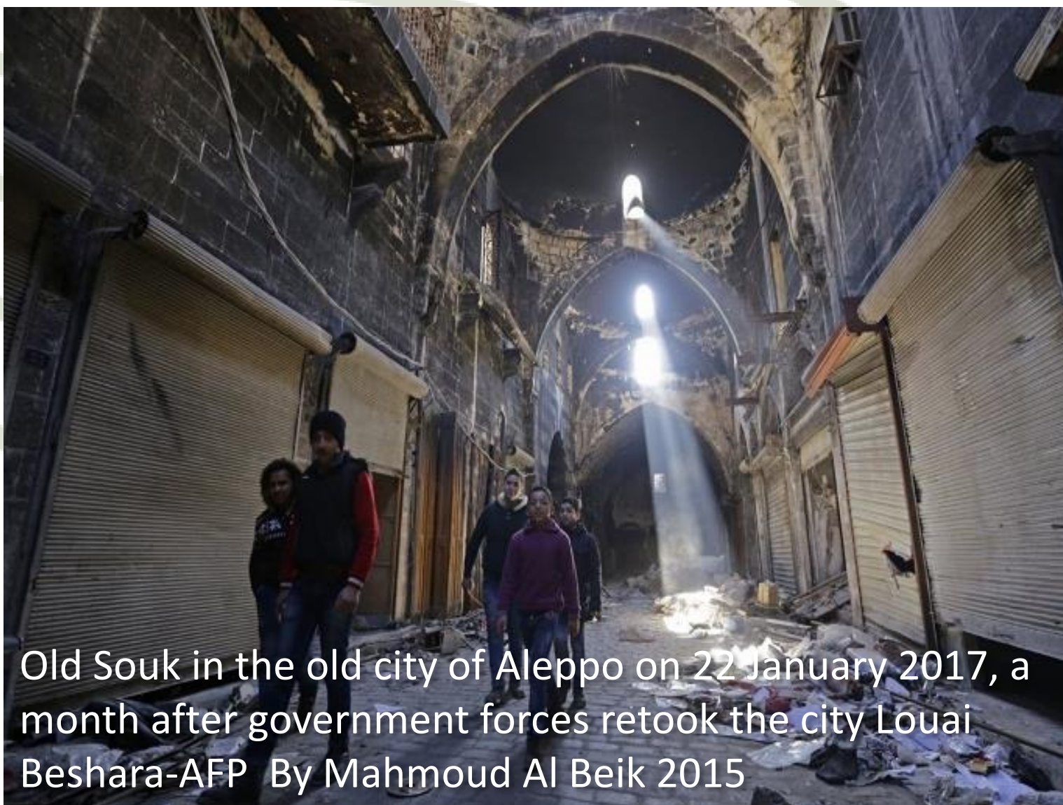
Old Souk in the old city of Aleppo on 22 January 2017, a month after government forces retook the city