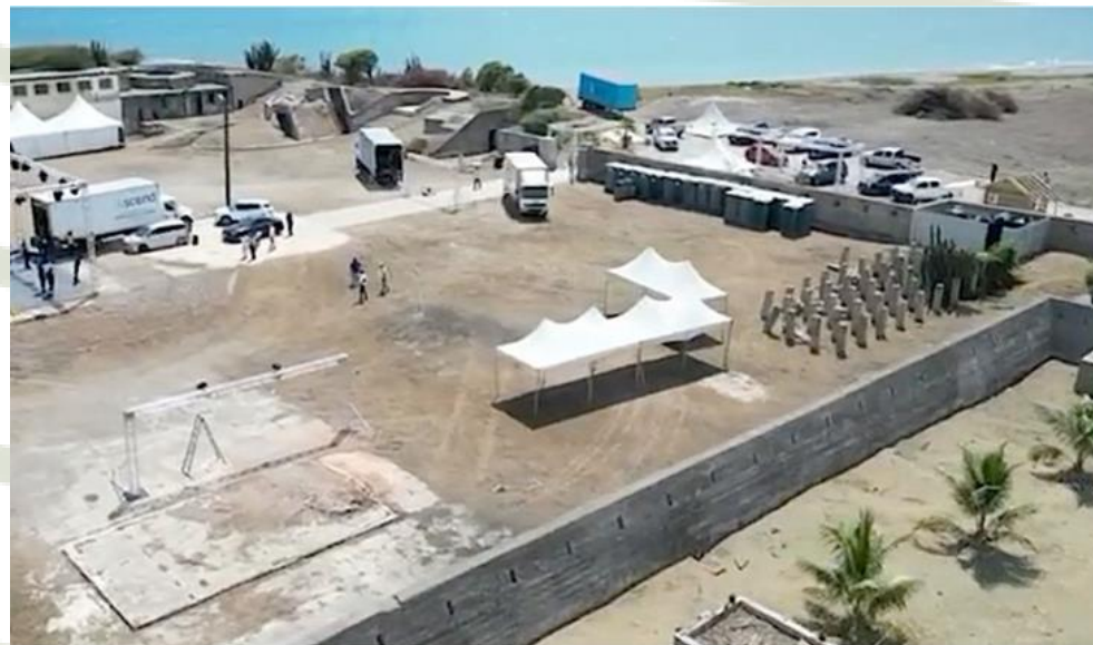
After Video clip image showing aerial view of Fort Rocky March 14, 2025