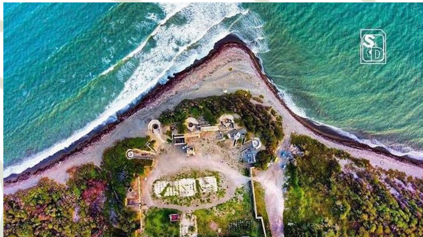
Before aerial view of Fort Rocky 2021